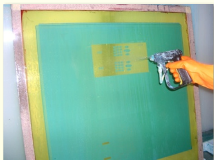
Step 1. After removal of ink, block-out, and tape, apply SMP® solution to a wet screen(both sides).

Emulsions, that are not properly broken down, will leave excessive residue on the mesh.