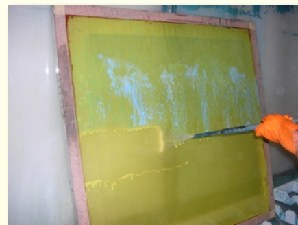
Step 3. High pressure rinse - starting at bottom.