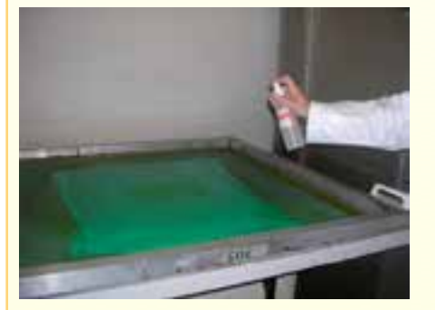
Step 1 . Spray VW INK WASH on squeegee side of screen.

VW INK WASH can be applied manually with a rag, spray bottle, or pneumatic pump systems.